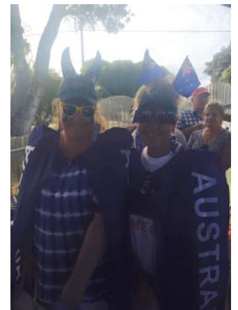
A couple of ladies who come to visit every year, love the costumes!